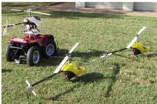
ARRI's fleet of UAV helicopters, including the all-terrain landing platform.

Plans are to design autopilots for autonomous maneuvers, landing, and formation control.