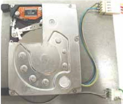
1.8" HGST Computer Hard Disk Drive for Portable Handheld Devices

The storage density requirements for computer hard disk drives are increasing with the push for miniaturization of mass storage for portable handheld devices, including cellphones, MP3 music players, and laptop computers. Dr. Lewis and his students have worked with Data Storage Institute in Singapore to develop nonlinear control systems with improved performance in the presence of shock and motion disturbances. Improvements in position error have been on the order of 22%.